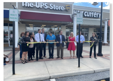
The UPS Store #1881 of Lake Shore Plaza

We had a Ribbon Cutting to welcome Proper Nutrition Café to the Pasadena business community and also the PBA. The protein shakes were delicious so stop in and try one.