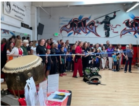
Jing Ying Institute of Kung Fu & Tai Chi